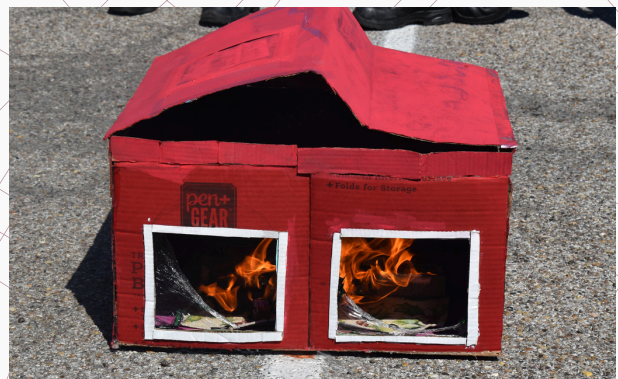
Our Forensic Science courses work together with ESC 2 to conduct arson investigations