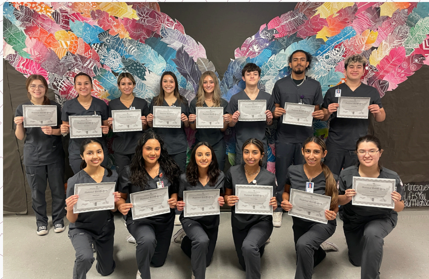
Students in our Health Science courses work hard, & earn National Certifications in their respective fields.

The Career & Technical Education Department is excited to have students back as we kickoff another great year of learning, innovation, and growth. Whether students are exploring a new pathway or continuing their journey, we are proud to support our students every step of the way.